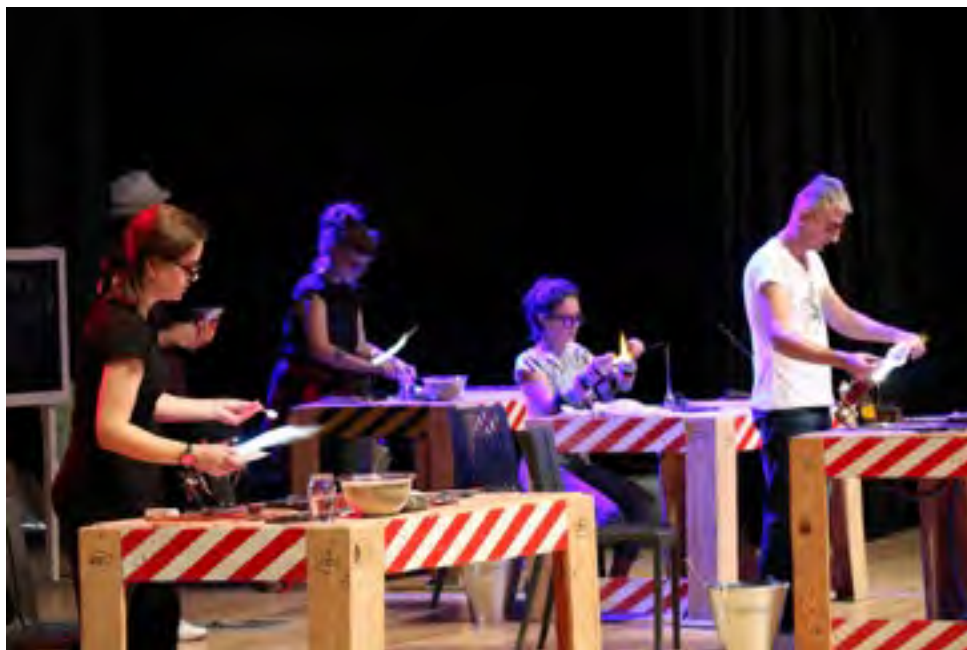
6th International Denizli Glass Biennale, During Live Framework Competition, 2021

Turkish Cultural Foundation lead the way in promoting Turkey's presence in contemporary glass art to the world. I hope the Glass Furnace Foundation, as an international space where master makers and artists share their knowledge and experience, will continue playing a part in Turkish art glass.