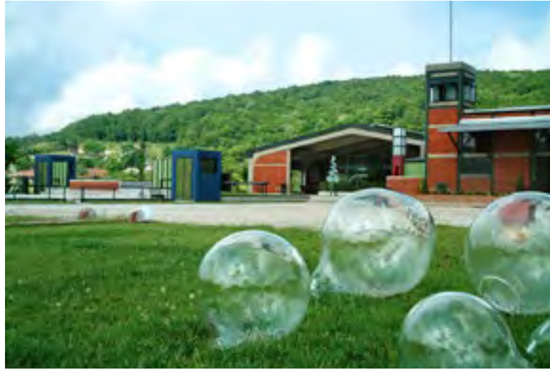
The Glass Furnace Foundation / Cam Ocagi Vakfi