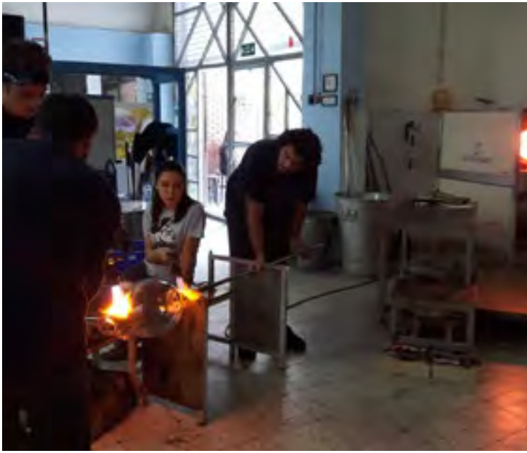
Glass Studio in Anadolu University Faculty of Fine Arts, Glass Department students blow glass, 2016

pictures for promotion, but understanding the scope of glass making and getting in touch with the people involved in the field, seeking opportunities of building up new projects and networks. As the partners of the field, the boundaries between the authorities and artists should be blended. The approach should be either all together or none of us go forward.