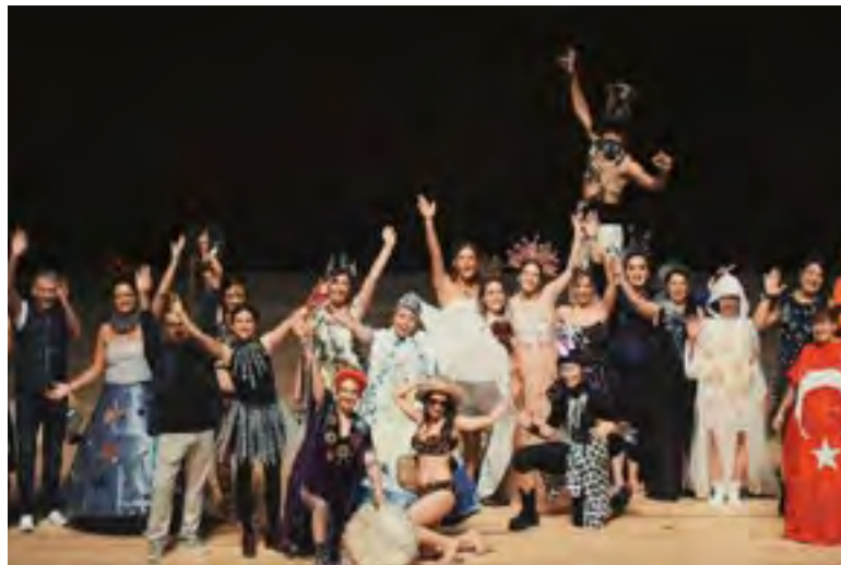
6th International Denizli Glass Biennale, The First Glass Fashion Show, 2021